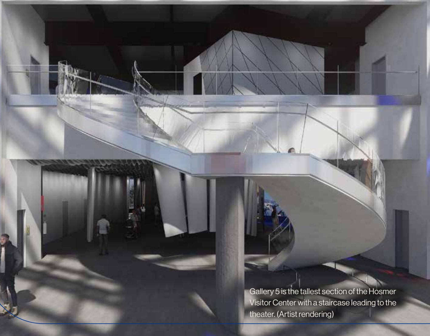
Gallery 5 is the tallest section of the Hosmer Visitor Center with a staircase leading to the theater. (Artist rendering)