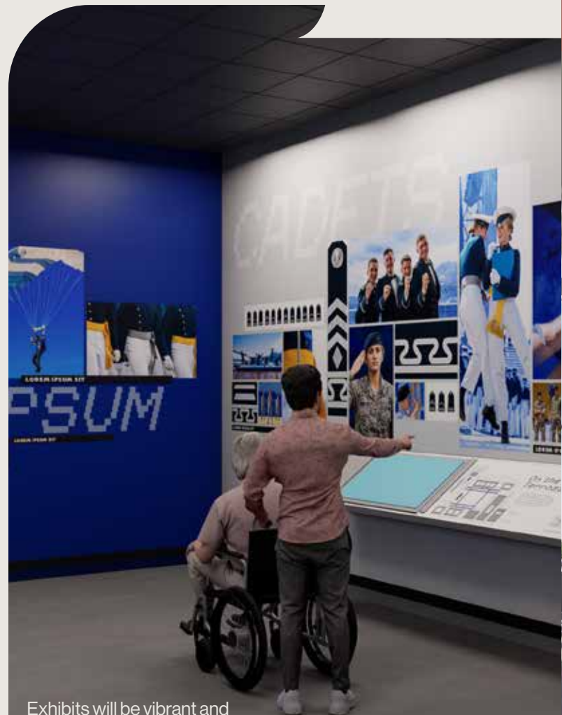
Exhibits will be vibrant and accessible. (Artist rendering)