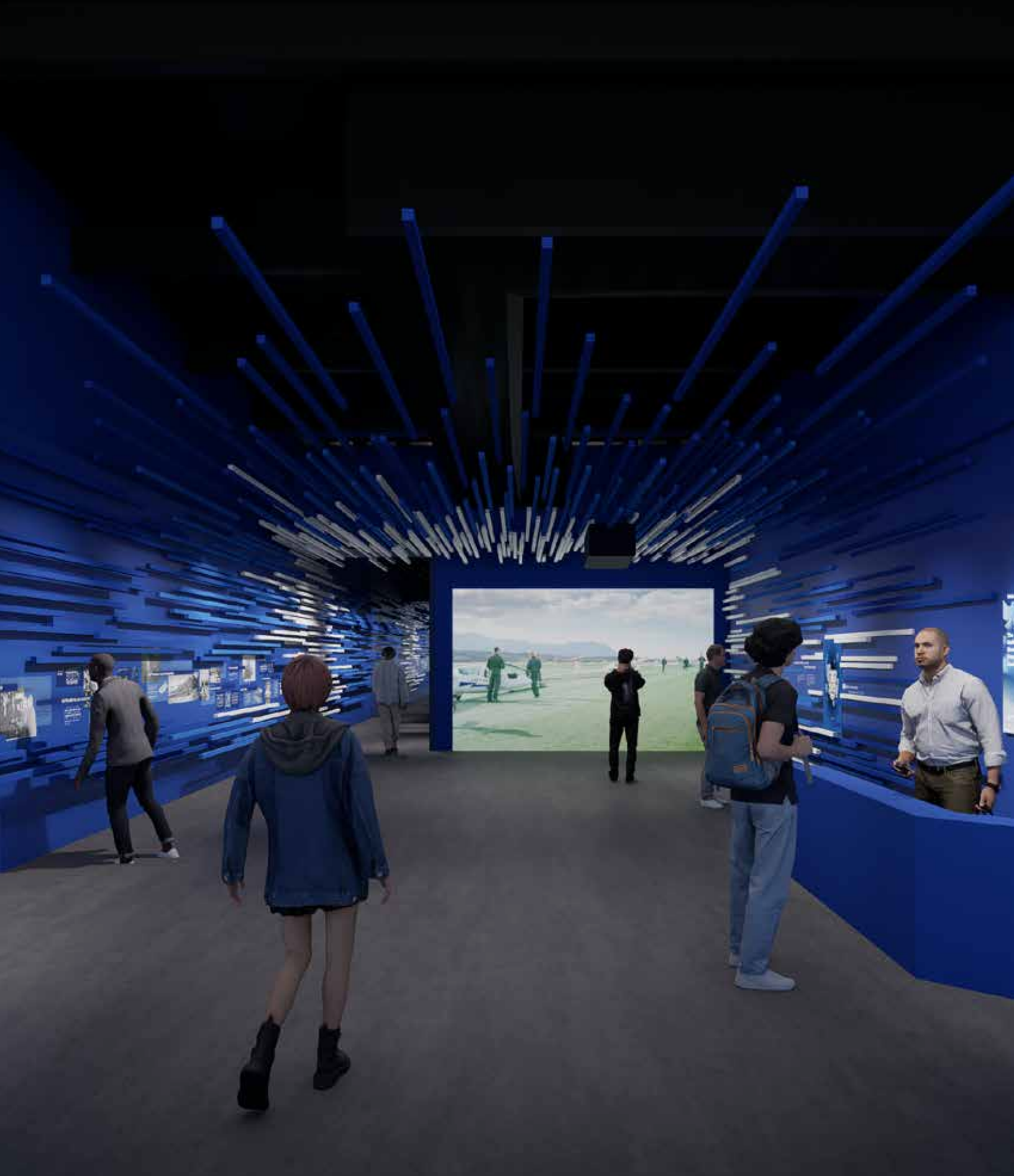
Gallery 1 will feature an introductory film and an interactive class crest exhibit. (Artist rendering)