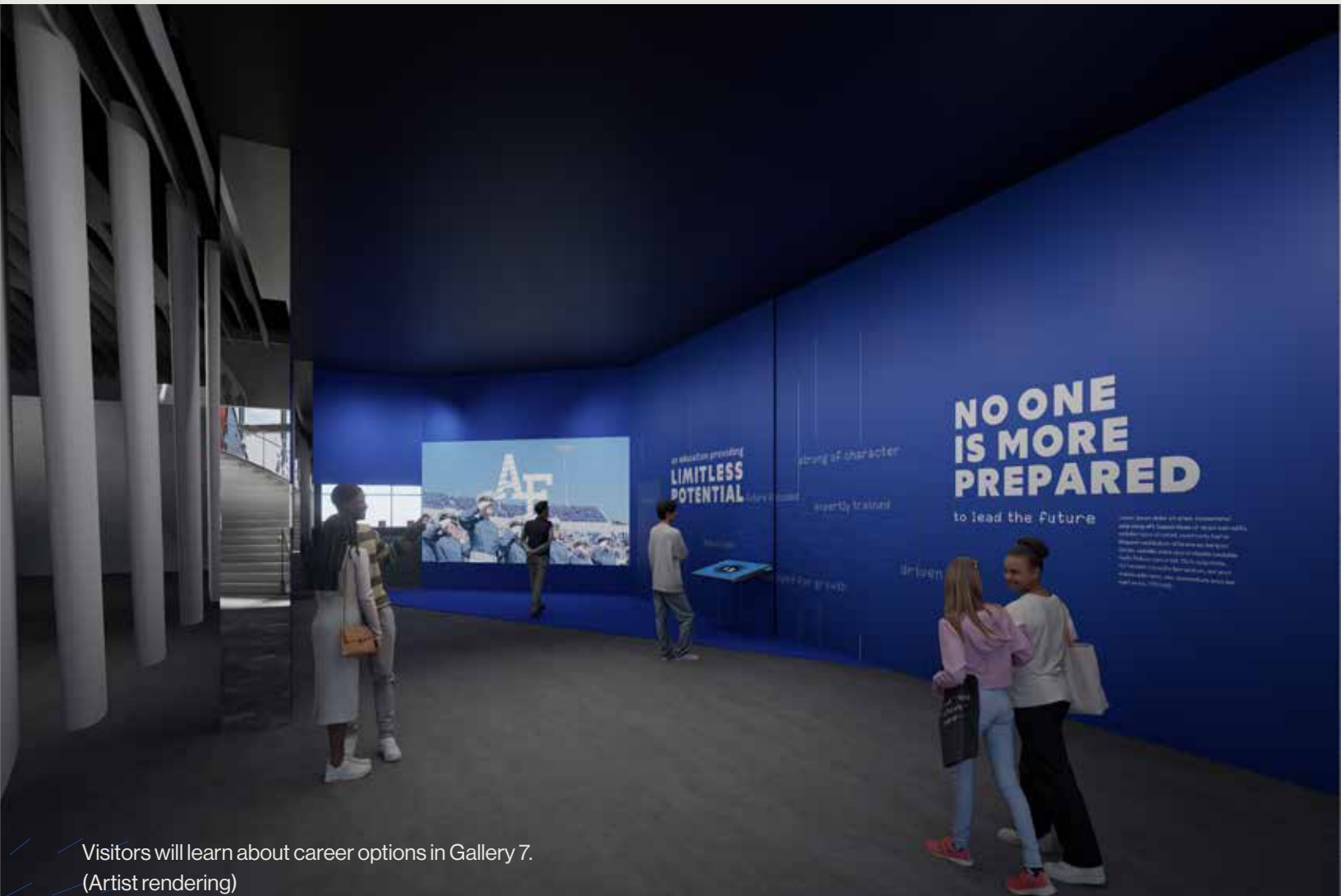
Visitors will learn about career options in Gallery 7. (Artist rendering)

When it opens, the Hosmer Visitor Center will serve as a prominent new front door for the Air Force Academy and a key component of the transformational TrueNorth Commons development, just outside the Academy's expanding North Gate. Additionally, the Hosmer Visitor Center's designation as an official Colorado Welcome Center along Interstate 25 will improve visibility, access and exposure to the service academy, which commissions nearly 1,000 Air Force and Space Force officers every year.